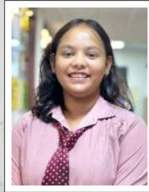
Mishita Singh Logistics