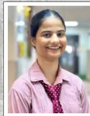
Surbhi Sahay Media & PR